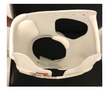
Figure 1. Cheneau–Toulouse–Munster Brace.