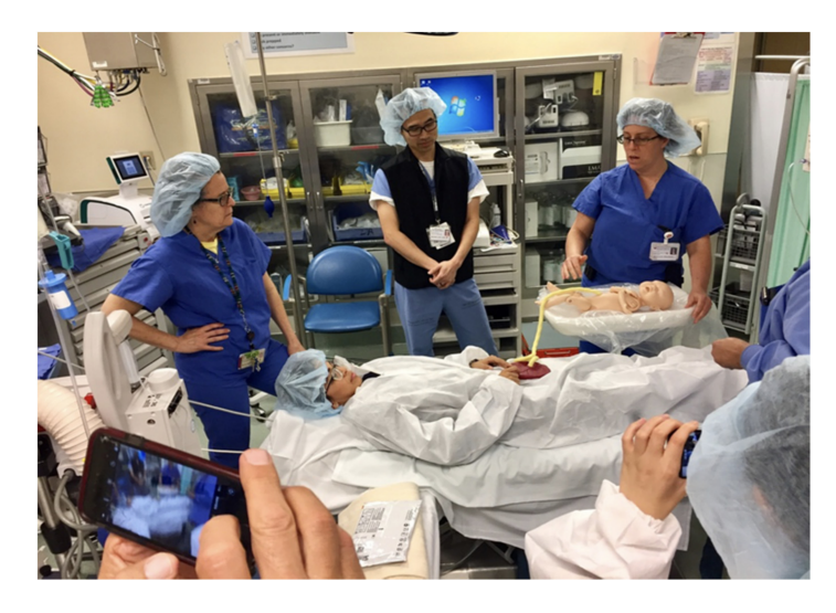
Figure 2. Delayed cord clamping cart in use during a simulation.