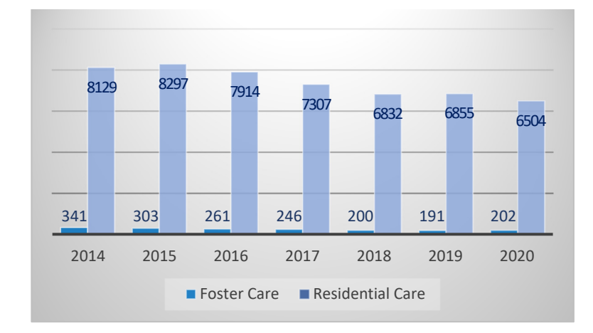
Figure 2. Number of children in alternative care in Portugal (2014–2020).

A decreasing trend of children in residential and foster care from 2014 until 2020 is observed in Figure 2, less 1764 children [34]. In 2014, there were 341 children in a foster family and in 2020 there were 202. For children in residential care, in 2014 there were 8129 and in 2020 they were 6504. One possible reason, among others, may be related to a crisis in birth-rate over the years in Portugal [32], consequently the number of children in residential care and in foster care decreased [34]. Therefore, it does not represent an investment in family-based care.