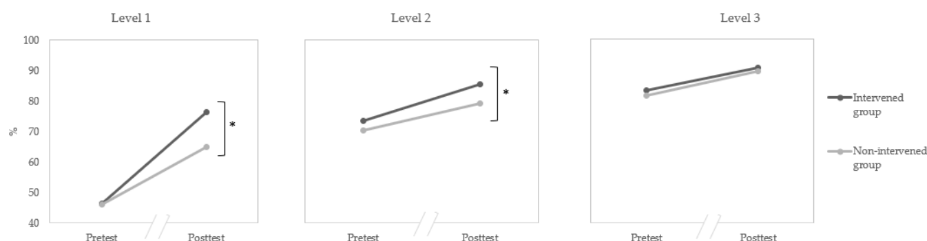
Figure 2. Percentage of correct responses (total score) in emotion tasks for the function of level, time, and group. The * sign means that the difference is significant ( p < 0.05 ).