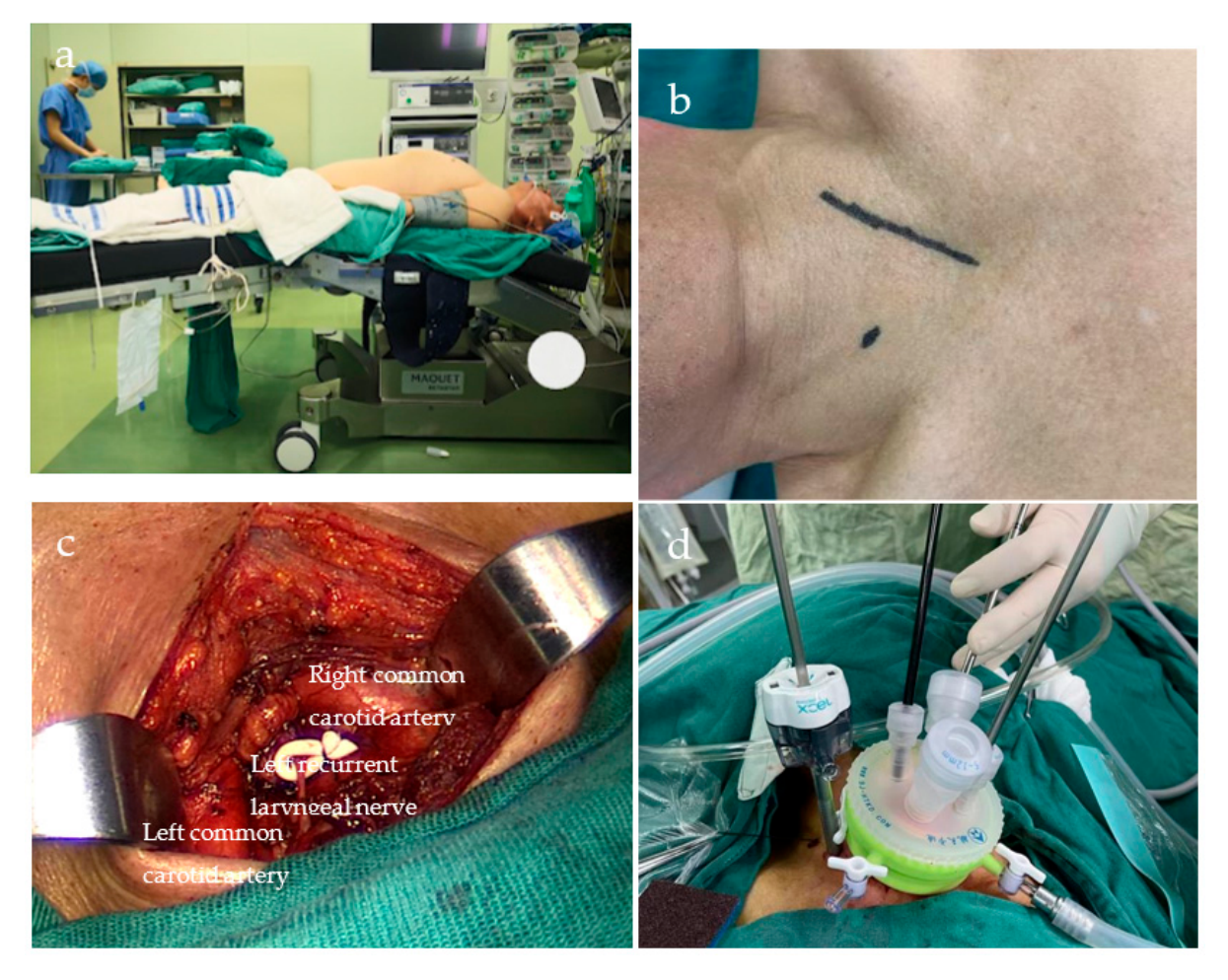
Figure 1. (a) Position of the patient, (b) cervical incision, (c) left cervical mobilization, and (d) dispensation of the cervical device.

placed on the left side, and a retractor is placed on the right side (Figure 1d). The esophageal wall is dissected in accordance with the sequence of "left—anterior—right—posterior" (Figure 2a). This is performed up to the carina level and is sometimes extended down to the inferior pulmonary vein level. During this process, various lymph nodes are also dissected, including the bilateral RLN, paraesophageal, tracheobronchial (No. 106tbL group), and subcarinal lymph nodes (Figure 2b). The authors concluded that dissecting the bilateral lymph nodes adjacent to the RLN is technically feasible through a left cervical incision under direct vision. By utilizing a suction apparatus and retractor, adequate exposure can be achieved while minimizing smoke interference, thereby decreasing surgical difficulty (Figure 2c,d). Morbidities associated with the IVMTE learning curve were analyzed. We found that improvements in the original technique allowed us to safely overcome the learning curve [30].