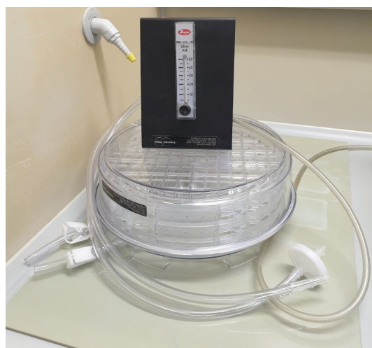
Figure 2. Hypoxia incubator chamber.

Variable durations of OGD can be used, depending on the purpose of the studies, and OGD could be applied intermittently or continuously. Regarding the duration of OGD, long-term protocols (from 40 min up to 72 h) are used to replicate hypoxia/ischemia-like conditions. In these protocols, ischemia/hypoxia can be followed by reperfusion, which has a significant impact on the outcomes of the experiment. This is perhaps most relevant and related to the effects of reperfusion on the changes in the intracellular \text{Ca}^{2+} levels [20]. Namely, it was found that during prolonged ischemia without reperfusion, there are two phases in the [\text{Ca}^{2+}]_i changes: hyperexcitation phase followed by the phase of global [\text{Ca}^{2+}]_i increase. If such a longer ischemic period is followed by reperfusion, this causes an additional sharp increase in [\text{Ca}^{2+}]_i and, subsequently, additional cell death. OGD can be used to study another experimental paradigm—the effects of and the possible neuroprotection provided by the hypoxic preconditioning. For example, these brief (3 to 10 min) hypoxic episodes have shown to alter glutamate receptor mediated [\text{Ca}^{2+}]_i response in hippocampal neurons [21].