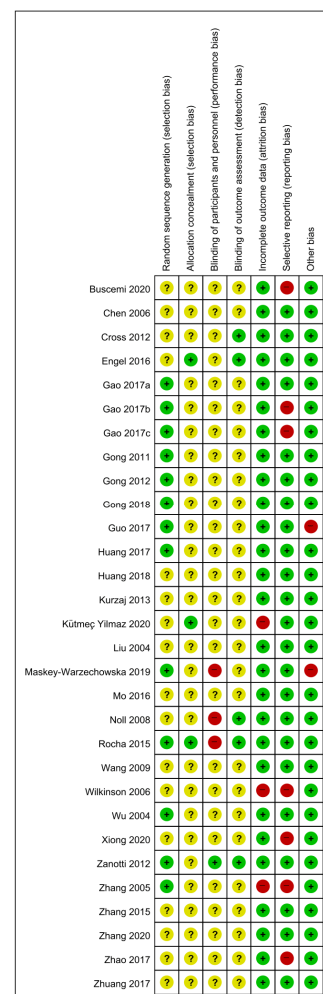
Figure 2. Risk of bias for all included studies. Low, unclear, and high risk, respectively, are represented with the following symbols: “+”, “?”, and “−”.

Thirteen studies [22–29,34,37,40,42,43] that used an appropriate random sequence generation method such as random number tables were evaluated as having a low risk of selection bias, and three studies [21,32,37] that properly concealed allocation using an opaque sealed envelope were also evaluated as having a low risk of selection bias. Three studies [34,36,37] that reported that the practitioners who were not blinded were at high risk of performance bias, and one study [42] that reported that both participants and personnel were blinded was evaluated as having a low risk of performance bias. Five studies [20,21,36,37,42] reporting blindness of outcome assessors were evaluated as having a low risk of detection bias. Three studies [32,39,43] that performed per-protocol analysis without specifying the reason for dropout were evaluated as having a high risk of attrition bias. Three studies [18,39,43] did not report raw data, and four studies [23,24,41,46] that did not report pulmonary function-related outcomes were evaluated as having a high risk of reporting bias. One study [28] without baseline characteristic data and one study [34] with cross-over design was evaluated as having a high risk of other potential biases (Figure 2).