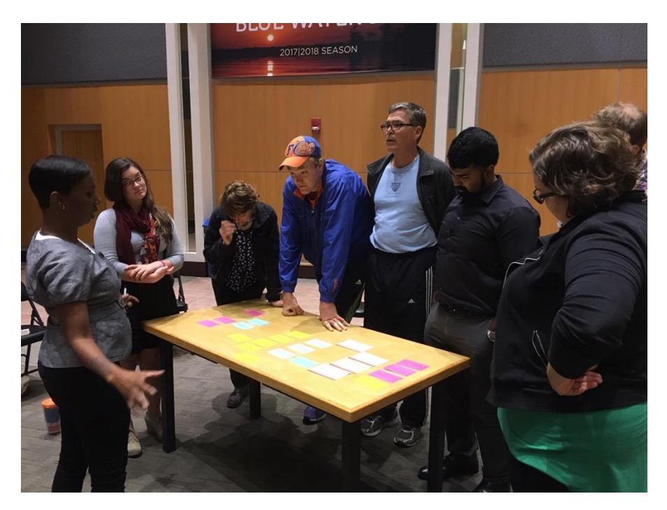
Figure 1. "Inside OCD" (obsessive compulsive disorder); participants and facilitators create the show through a process of collective dramaturgy involving note cards.

Once participants had selected and collaboratively shaped two to three stories each, the stories were distilled onto thematically color-coded index cards. The cards were then laid out on a table and together group members decided the running order of the stories (Figure 1). This method of collective dramaturgy allowed the group to control both the structure and content of the show and empowered them to develop the meta-story arc of the show. The program director then staged the stories in order to create a cohesive theatrical performance.