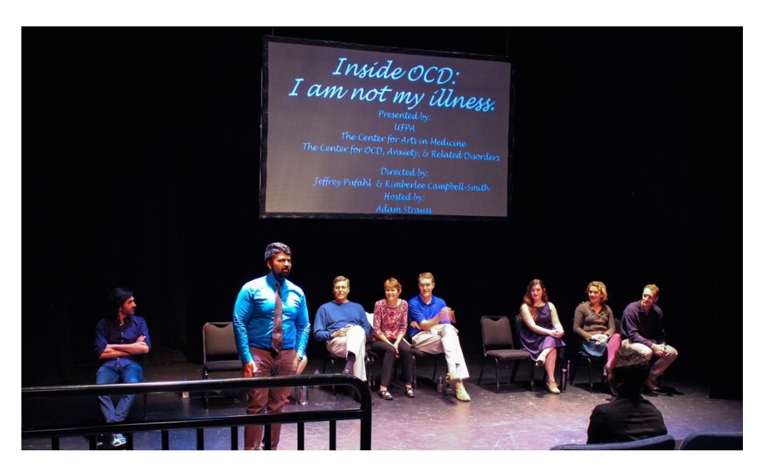
Figure 2. Participants perform "Inside OCD" at the University of Florida.