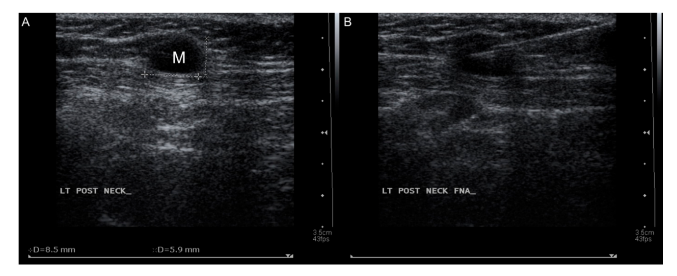
Figure 1. ( A ) Targeted ultrasound revealed an ovoid hypovascular hypoechoic mass with a short axis of about 0.6 cm and preserved. ( B ) Fine needle aspiration cytology was performed using a 21-gauge needle.

Based on the histopathological report and serological results, an infection specialist prescribed pyrimethamine (25 mg/tab) to treat the T. gondii infection. The postoperative surgical wound healed well. The patient's Toxoplasma IgG and IgM levels returned to the normal range at the completion of the treatment course.