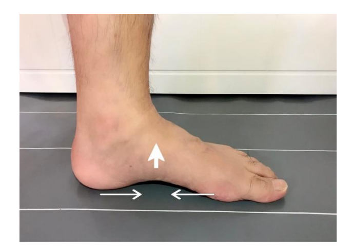
Figure 1. Short-foot exercise.