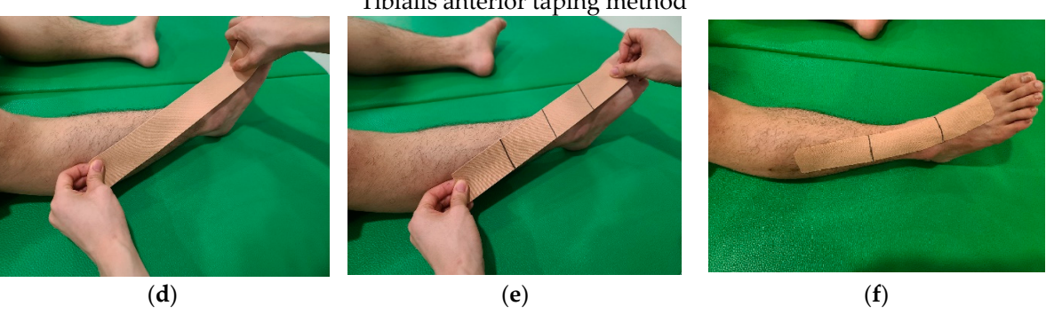
Figure 1. Diagram of taping method is as follows: ( a ) Measure muscle length with tape; ( b ) divide the length of the tape into 4 equal parts; ( c ) attach to muscle while stretching tape with 1/4 length removed; ( d ) Measure muscle length with tape; ( e ) divide the length of the tape into 4 equal parts; ( f ) attach to muscle while stretching tape with 1/4 length removed.