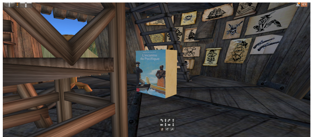
Figure 1. Photograph 1. In the pirate port, the headquarters of an explorer group.

For the French lesson, the teacher designed an activity within the interdisciplinary projects ‘Explorateurs’ (Figure 1). She divided the class into various groups, each taking on the identity of an explorer. Each of them was assigned a book and several students. Various activities were carried out, such as writing a poem. The students had to share ideas through the chat. This teacher’s creativity led her to ideate Headquarters (HQ) for each explorer in a location called ‘Pirate Port’ built specifically for this great explorers’ project. Two elements indicated the location of each headquarter: a cube to which the cover of the book in question was affixed and the coat of arms of the explorer invented by the students. For each group activity, the students, via their avatars, met in their respective headquarters to exchange and solve the language learning task. The students were both in a physical area of the classroom and in a virtual location symbolising their working theme.