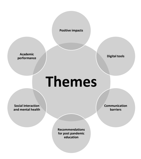
Figure 2. Distinct themes from thematic analysis.