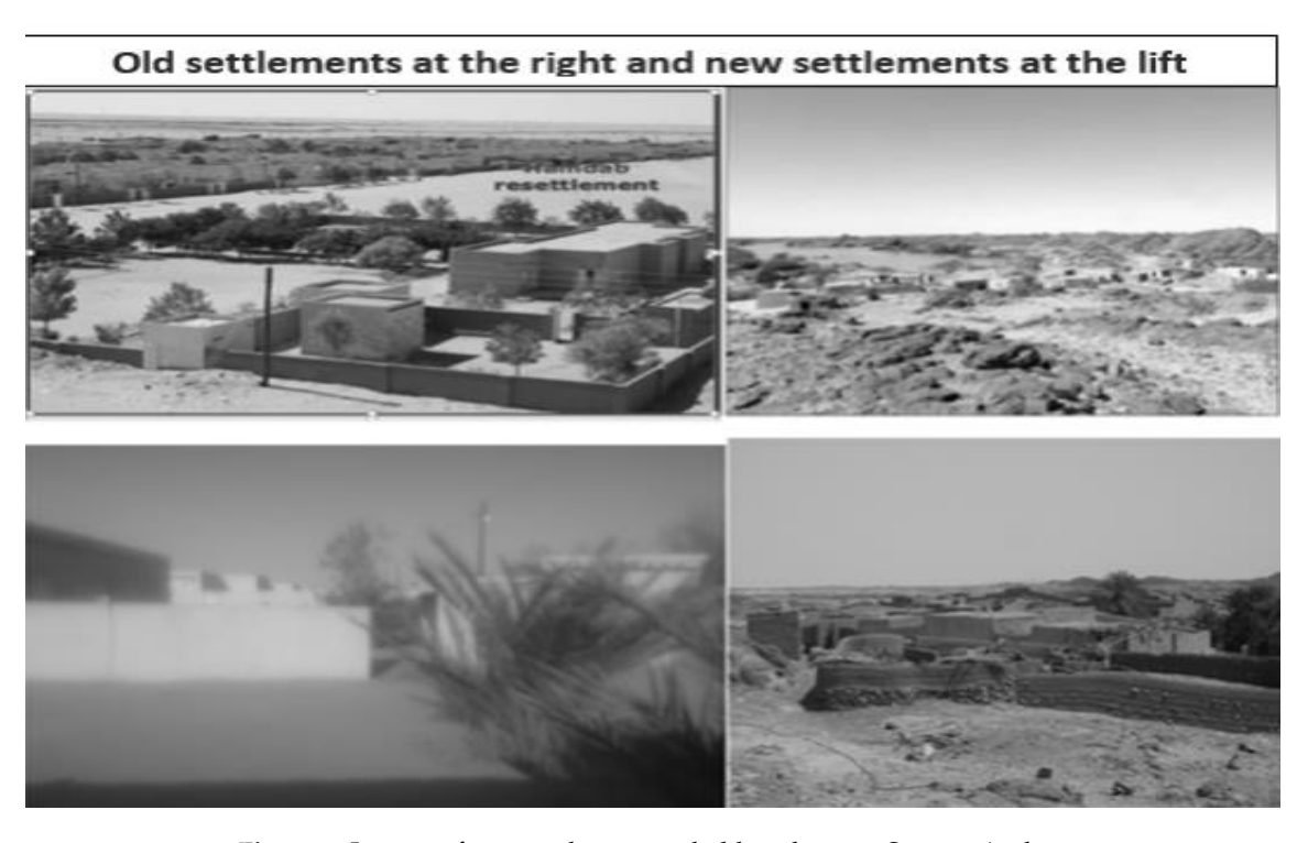
Figure 2. Images of new settlement and old settlement: Source: Author.

These opinions about the new settlement are supported by many respondents who challenge the critics of dam resettlement, such as Scudder (2012) and Jackson and Sleigh (2000). Singh's study of 50 large dam resettlements in five continents (1997) acknowledged that living standards in resettlement areas have improved slightly and livelihoods have been restored to some degree. The Sudanese government's misrepresentation of the Merowe Dam resettlement through its control of the media portraying the substantial facilities of the new houses, land, services, and financial compensation misled the Sudanese public and encouraged a dialogue that was critical of the Manasir, and others affected who protest or show dissatisfaction with resettlement.