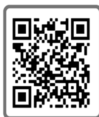
FDA Molnupiravir Fact Sheet for Health Care Providers