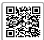
FDA Paxlovid Fact Sheet for Health Care Providers