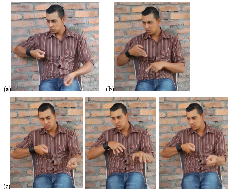
Figure 1. Examples for responses of iconic handshape types: (a) Handling [mop], (b) Object [hand saw], and (c) Handling+Object [rake]. See supplementary materials to view video clips of responses.