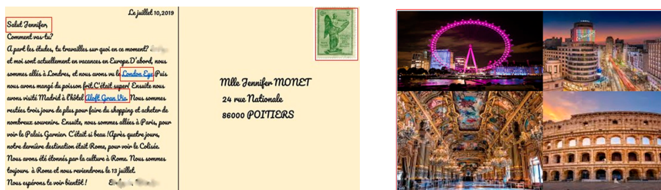
Figure 1. A screenshot of Britney and Eva’s digital postcard entitled “Un voyage touristique en Europe” (Sight-seeing in Europe).