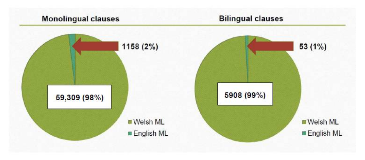
Figure 5. Quantitative distribution of matrix language in Siarad corpus.

deciding to use it in our analysis, however, we evaluated four alternative models according to whether or not they (1) were designed to deal with production data; (2) could analyse individual clauses; and (3) applied to both monolingual and bilingual data. The MLF was the only model evaluated which satisfied all criteria (see Carter et al. 2011, p. 157) and was chosen by us for our analysis. A quantitative implementation of it, coding all clauses as either bilingual or monolingual and identifying the matrix language of each clauses, allowed Deuchar et al. (2018) to arrive at a characterization of the Siarad corpus as shown in Figure 5.