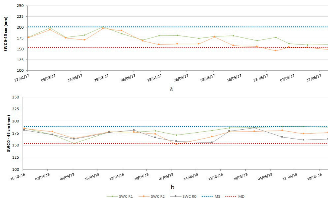
Figure 2. Soil water content (SWC; mm of water in the 0–45 cm soil profile) in the different water regime treatments. a –2016/2017 crop cycle; b –2017/2018 crop cycle. R1, irrigation with 100% of E_{TC} ; R2, irrigation with 100% of E_{TC} at critical stages of beginning of stem extension, booting, heading, and grain filling. MS, maximum storage during the growth cycle (mm of water in the 0–45 cm soil profile); MD, maximum allowed depletion during the growth cycle (mm of water in the 0–45 cm soil profile).

fertilizers, C1 to C5, on grain yield and grain yield components), while in the 2017/2018 experiment (to evaluate the effect of three irrigation regimes—R1, R2, and rainfed (R0)—and eight nitrogen fertilization treatments of type/splitting/timing with enhanced efficiency N fertilizers and conventional fertilizers, N1 to N8, on grain yield and grain yield components), the average yield reached 7100 \text{ kg ha}^{-1} , which was, respectively, 1.7 and 1.6 times higher than the previous years.