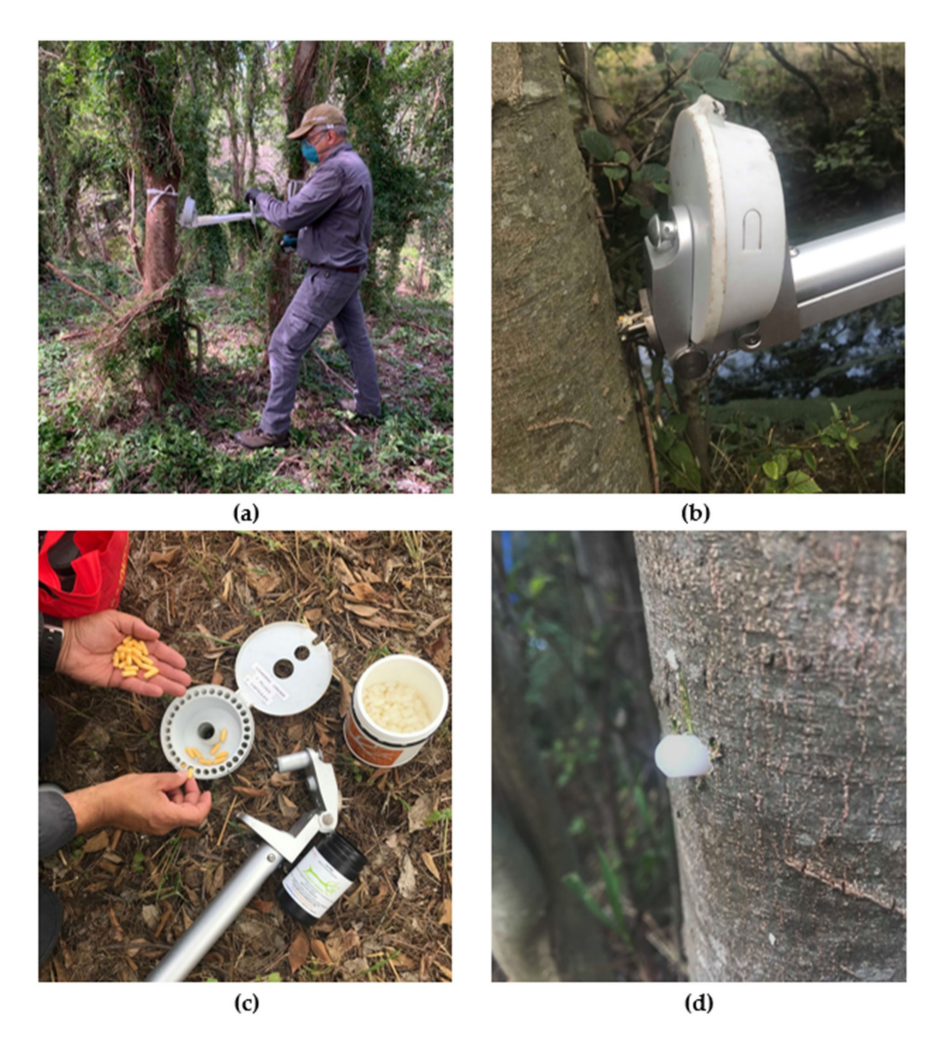
Figure 3. (a) Implanting a synthetic herbicide capsule into the stem of a C. sinensis plant using the InJecta<sup>®</sup> handheld device; (b) rotating drill bit (8 mm) creating a hole into the plant stem; (c) loading the magazine with synthetic herbicide capsules and polypropylene plugs; (d) polypropylene plug partially protruding from the implantation site of a treated C. sinensis plant.

The basal application of Access<sup>TM</sup> (Corteva Agriscience Pty Ltd., Sydney, NSW, Australia) herbicide (240 g/L triclopyr, 120 g/L picloram, and 389 g/L liquid hydrocarbon) with diesel (dilution rate of 1 L/60 L) was achieved with a manual pressure sprayer (Nylex 8 L Heavy Duty Shoulder Sprayer; Ames Australia, Doncaster, Victoria, Australia). The entirety of the stem and root collar area was treated liberally from ground level to an approximate height of 60 cm (as per manufacturer's instructions) for sufficient penetration through the bark. The appropriate safety equipment (Bossweld elbow-length gloves (Dynaweld, Prestons, NSW, Australia), valved activated carbon respirator (3M Australia Pty Ltd., North Rhyde, NSW, Australia, and covered clothing) was worn during the preparation and application of the solution.