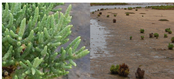
Figure 1. A. indicum plant.

Arthrocnemum indicum (macrostachyum) (Figure 1) is a stem-succulent perennial, greenish-pinkish, shrubby halophyte plant that belongs to the family of Amaranthaceae (Chenopodiaceae). These species of plant are low shrubs that grow up to 1.5 m, much-branched from the base, and frequently form mats. This plant is abundant in saltmarshes along the coastlines of Europe, South-West Asia, and North Africa [18]. In folkloric medicine, A. indicum has been commonly used to treat poisonous bites and stings and possesses beneficial effects against numerous other diseases [16]. The antiproliferative effect of A. indicum shoot (leaves and stems) extracts was compared to the control, and the results are very encouraging [8].