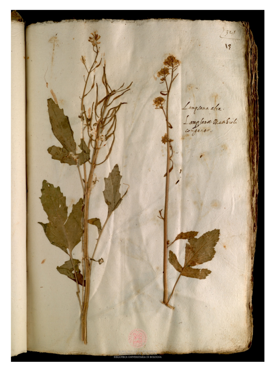
Figure 4. Specimen of Sinapis alba L. preserved in Erbario Aldrovandi, vol. IV, c. 13r.; on the sheet, "Lampsana alia, Lampsanæ Matthioli congener" is written.