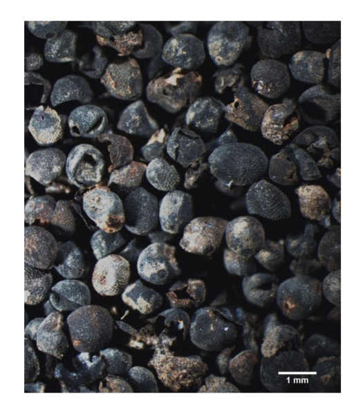
Figure 5. Brassica sp.pl. seeds from context I (Ferrara-no. 16c).