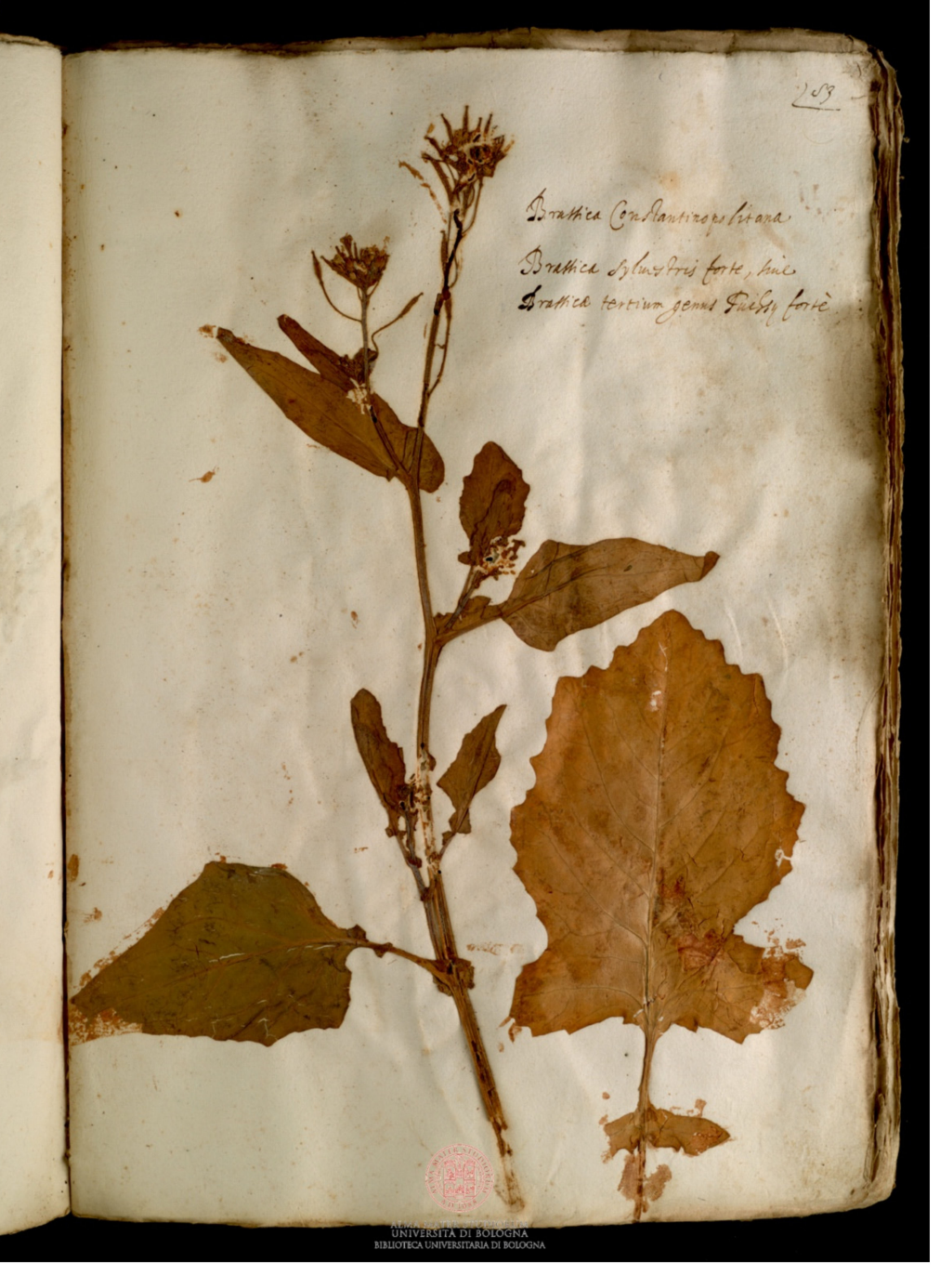
Figure 3. Specimen of Brassica rapa L. preserved in Erbario Aldrovandi, vol. V, c. 83r.; on the sheet, "Brassica Constantinopolitana, Brassica syluestris forte, siue Brassica tertium genus Fuchsij forte" is written. COPYRIGHT © Università di Bologna/Sistema Museale di Ateneo—Erbario e Orto Botanico.