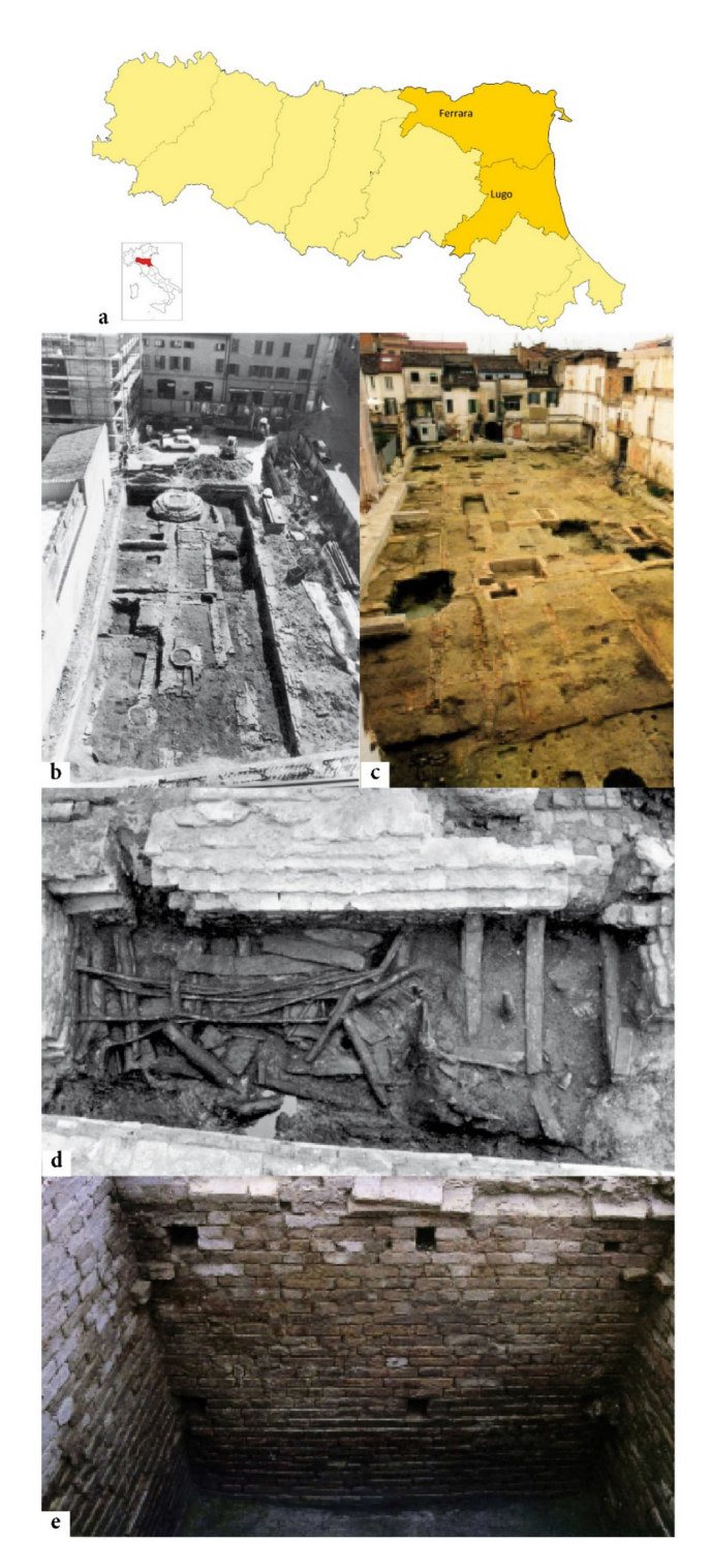
Figure 1. The two archaeological sites examined: Ferrara (context I—no. 16c) and Lugo (context II—no. 15); geographic location ( a ), overview of archaeological excavation ( b , c ) and pits ( d , e ).