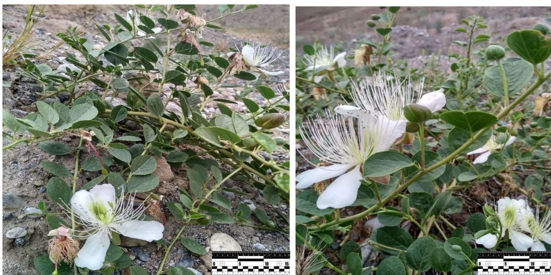
Figure 2. The plant C. spinosa L. growing in the experimental area (Scale: 1:50).

In biogeochemical research, the identification of correlations between the chemical, more precisely the elemental composition of plants and the elemental composition of the soils in which they grow is of great scientific and practical importance in establishing programmed yields in agriculture. In particular, knowledge of the exact amount of macro and micronutrients in the generative and vegetative organs of the plant C. spinosa L. roots, stems, leaves, buds, flowers, fruits also expands the use of this plant species in phytobars, food and pharmaceutical industries.