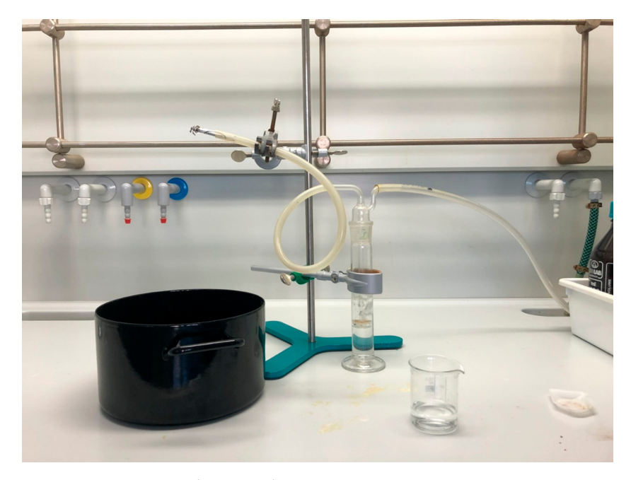
Figure 3. Cigarette smoking simulation setup.

Different setups were used to extract alkaloids from smoke. We initially used the root powder so that results would be comparable to the other extractions; however, it proved resistant to burning. We then switched to the powdered leaves. Our initial setup (Figure 3) involved simulating the use of a hand-rolled cigarette. The burn of the cigarettes proved difficult to control and many parts fell off unburnt. As such, we switched to a setup simulating a pipe (Figure 4) that had a constant flame applied in order to create more standard measurements and ensure complete combustion of the plant material. The smoke was then pulled through 50 mL of 0.15% HCl with 20 mL of dichloromethane; since the two substances do not mix, the dichloromethane was introduced to raise the volume, thus allowing the HCl to be on the active part of the apparatus. This dichloromethane was treated as a first wash and was followed by 2 \times 20 mL dichloromethane washes, each being discarded after application. 30-33% ammonium hydroxide was then used to bring the pH to 8–10.