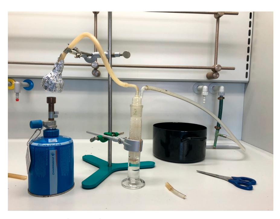
Figure 4. Pipe smoking simulation setup.

The samples then went into phase 2 of the extraction, as described below in Section 2.3.7.