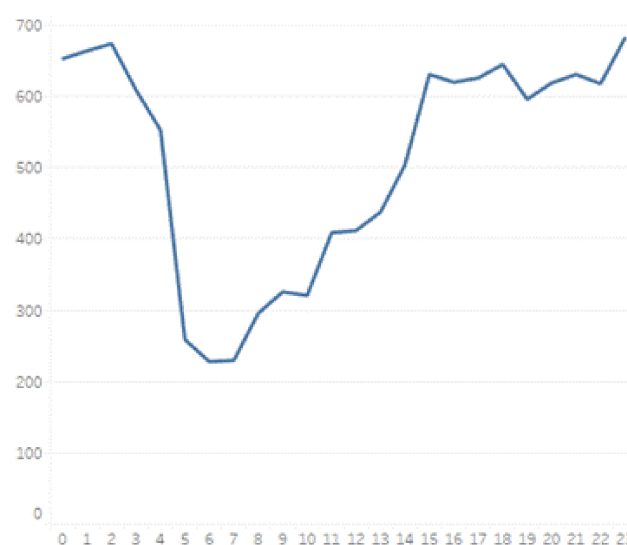
Figure 1. Time series plot of assaults in Manhattan, NY. The number of assaults increases from 7 a.m. to 11 p.m. (where 11 p.m. is the peak of assaults), and decreases during night hours from 1 a.m. to 6 a.m.

Assaults have been selected for a more detailed analysis, using time series and hot spot analysis of data. To see how the location and intensity of assaults varies within Manhattan, NY in a 24 h period of a day, the model has classified data into 24 classes based on the time when the assault occurred, for instance, 0–1 a.m. class, 1–2 a.m. class, etc. Time series analysis reveals trends in time classes for assaults. It can be identified that the least number of assaults happen at 7 a.m. (230 assaults) and the most at 11 p.m. (682 assaults) (Figure 1). It is also clear from Figure 1 that the number of assaults gradually increase from 7 a.m. to 11 p.m., with a decrease observed from 1 a.m. to 6 a.m. (Figure 1). This is explained by human activities during morning-day-evening hours, and night hours accordingly.