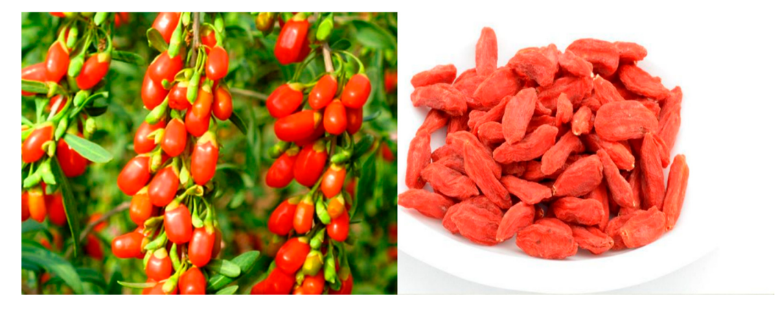
Figure 1. The fresh (left) and dried form (right) of Lycium barbarum fruit.