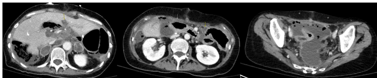
Figure 5. CT of the abdomen/pelvis after second CRS/HIPEC. Arrows indicate sites of residual postoperative collections.

The patient recovered from this extensive surgery without any acute surgical complications. She required postoperative parenteral nutrition due to failure to thrive and malnutrition. Several MRI scans of the patient's peritoneum showed post-operative changes consistent with fluid collection. The follow-up CT scans over 5 months (Figure 5), 9 months, and 16 months all appeared to be stable.