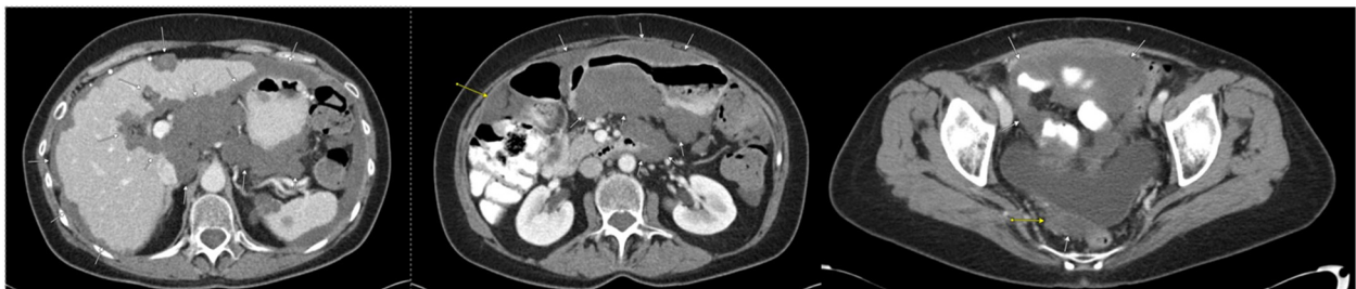
Figure 4. First CT scan of abdomen/pelvis after initial CRS/HIPEC to show disease progression. Arrows indicate diffuse and enlarged mucinous peritoneal metastases and demonstrate interval increase in tumor burden.

Repeat CT after four lines of systemic chemotherapy showed no intrathoracic metastasis and a diffuse, increased volume of low-density peritoneal disease that was more extensive than that observed in prior imaging, with a clear progression of disease in the pelvis and upper abdomen (Figure 4). At this point, the patient was referred to our program for cytoreduction. Given the patient's young age, the fact that nearly two years had passed since the original cytoreduction, and the patient's excellent performance status, we decided to proceed with repeat cytoreduction despite the presence of extensive peritoneal disease.