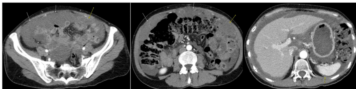
Figure 1. Initial CT scan of abdomen/pelvis completed at time of diagnosis. Arrows indicate diffuse mucinous peritoneal metastases throughout the abdomen and pelvis.

A 53-year-old female with a medical history of cesarean section and bilateral tubal ligation presented to her primary care physician with a six-month history of abdominal distention, bloating, early satiety, and unintentional weight loss amounting to 25 pounds. At this point, a CT scan of her abdomen and pelvis revealed ascites, peritoneal implants, and bilateral adnexal masses (Figure 1). The observed tumor markers were as follows: CA 19-9—1398 units per milliliter (U/mL); CA-125—118 U/mL; and CEA—55.4 micrograms per liter (µg/L). Cytology from her paracentesis revealed adenocarcinoma that immunohistochemically favored an upper gastrointestinal versus a pancreaticobiliary origin. However, EGD, EUS, and colonoscopy revealed no masses in the stomach, duodenum, pancreas, liver, or colon, hence indicating a possible appendiceal origin.