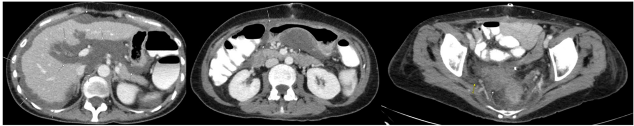
Figure 2. CT scan of the abdomen/pelvis conducted after first CRS/HIPEC. Arrows indicate residual mucinous peritoneal metastases and demonstrate interval reduction in tumor burden.

FOLOFOX, FOLFIRI, and FOLFIRI with Bevacizumab and Lonsurf Trifluridine/Tipiracil (TAS-102) with down-trending CEA (Figure 3); however, there was no significant imaging response.