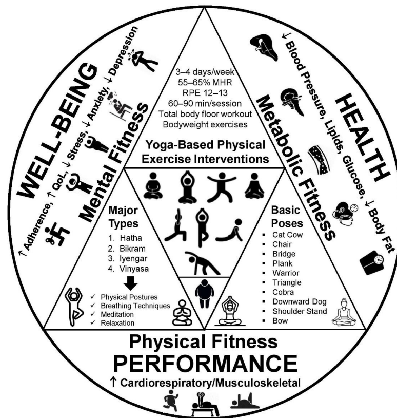
Figure 1. The psychophysiological effects of yoga interventions in overweight and obese individuals. MHR: maximum heart rate; RPE: rating of perceived exertion. [34,43,46,56,57].