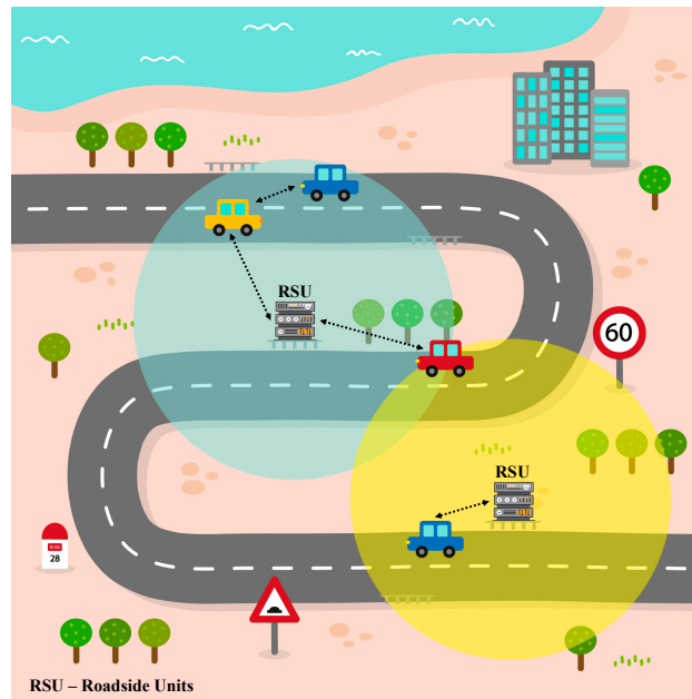
Figure 1. Example of a vehicular network scenario, considering both types of communication between nodes (V2V and V2I), where mobility management functions are needed to enable communication between different groups of mobile nodes.

The most relevant proposals and approaches for monitoring and management functionalities are presented and discussed in this section as well as the major open issues, which will allow new approaches to be proposed that can overcome some of these issues.