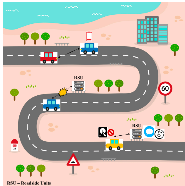
Figure 3. The limitations of a vehicular network scenario (e.g., low power, full storage, message's time-to-live, bandwidth) that new communication, data, and resource methodologies must deal with to improve overall network performance.