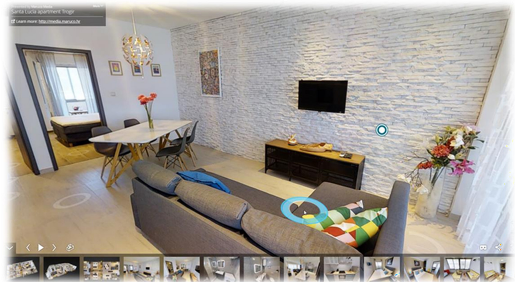
Figure 3. 3D model of space. Reprinted/adapted with permission from Matterport website [79]. 2022, Matterport, Inc.

Pandžić et al. [34] state that, with the dollhouse view option, the users can rotate the entire object in all directions as if holding it in the palm of their hand. This comprehensive real-time recording system with interactive 3D and VR experience creates an emotion as if users are really in it. For example, imagine a table in the kitchen—VR technology allows us to see it from various perspectives, and move around it, while other virtual walks show it only as a 2D part of the photo. 3D info tags provide an interactive, informative dimension to a presentation through which visitors can be introduced to specific products and services (Figure 4).