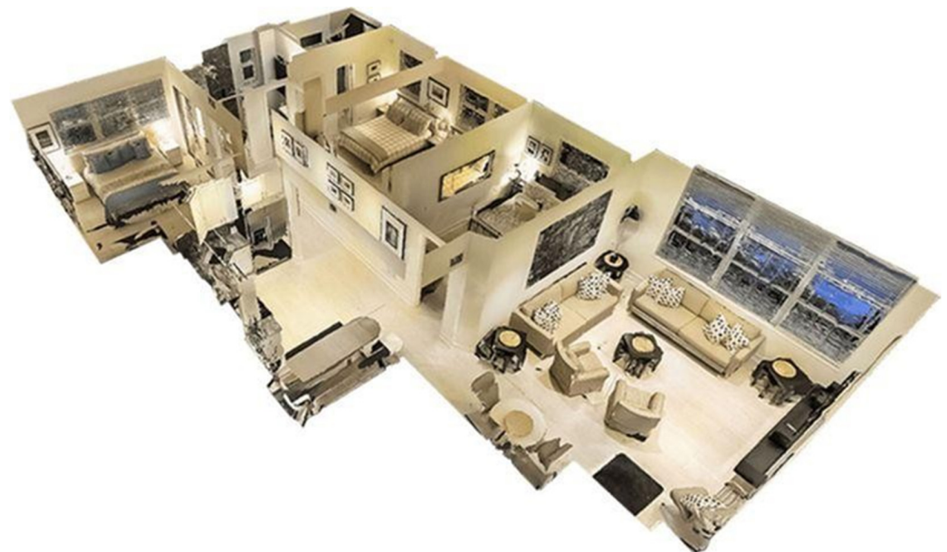
Figure 4. 3D of space. Reprinted/adapted with permission [80]. 2022, i.pinimg.com.

Pandžić et al. [34] state that, with the dollhouse view option, the users can rotate the entire object in all directions as if holding it in the palm of their hand. This comprehensive real-time recording system with interactive 3D and VR experience creates an emotion as if users are really in it. For example, imagine a table in the kitchen—VR technology allows us to see it from various perspectives, and move around it, while other virtual walks show it only as a 2D part of the photo. 3D info tags provide an interactive, informative dimension to a presentation through which visitors can be introduced to specific products and services (Figure 4).