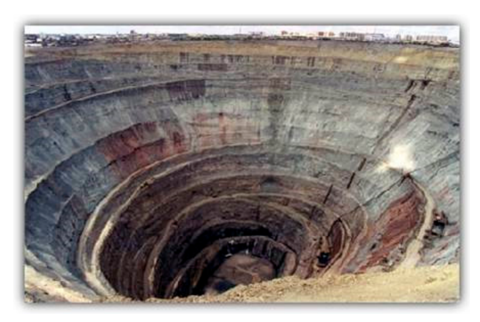
Figure 2. "Aikhal" Open-Pit Mine, open-pit diamond mining.