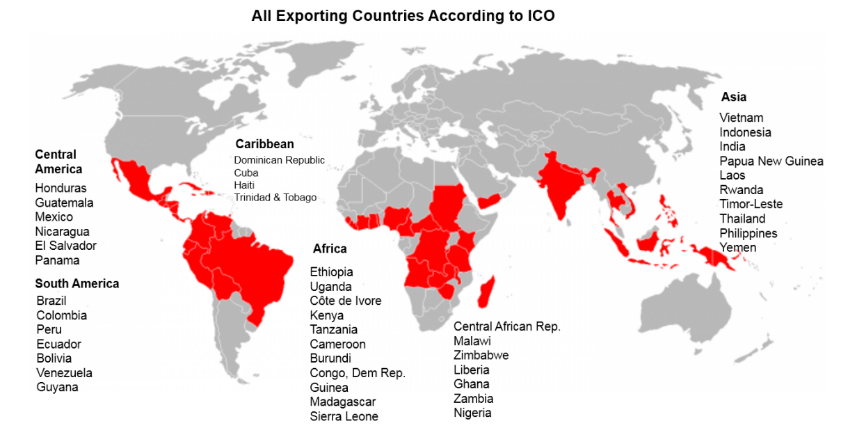
Figure 1. Major coffee exporting countries and members of International Coffee Organisation (ICO).

The last few decades have brought significant changes to the coffee industry. As a result of the abolishment of the economic clauses of the International Coffee Agreement (ICA) in 1989 [6–8] and the expanding supply of Brazil and Vietnam, an ensuing period of low and more volatile green (unroasted) coffee prices brought very difficult times to millions of producers in over 40 countries. At the beginning of the 21st century, coffee growers faced the lowest real prices on record for their beans during the "coffee crisis" period.