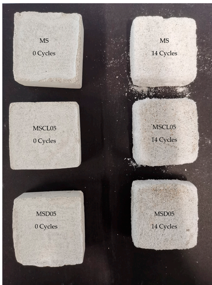
Figure S1. MS series samples (part 1) before (left) and after (right) 14 saline cycles.

* Correspondence: 858827@stud.unive.it; Tel.: +39-3808965178