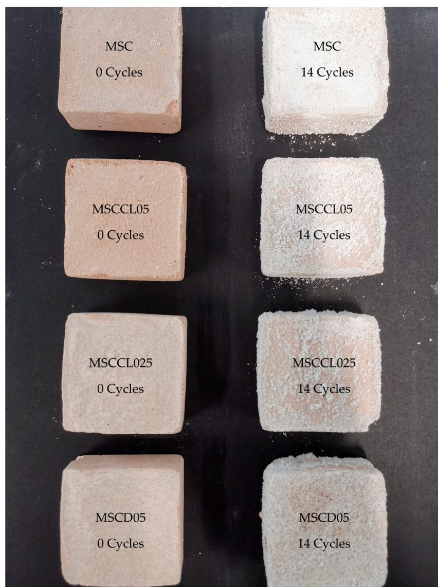
Figure S3. MSC series samples (part 1) before (left) and after (right) 14 saline cycles.