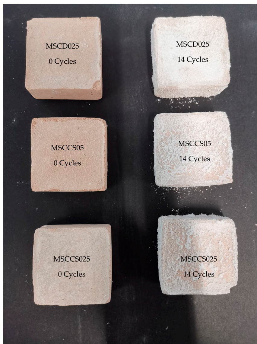
Figure S4. MSC series (part 2) samples before (left) and after (right) 14 saline cycles.