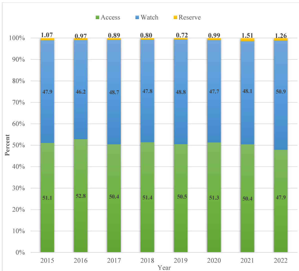
Figure 3. Yearly antibiotic community consumption (packages dispensed) using the WHO AwaRe classification, Cyprus, 2015–2022.

Community antibiotic consumption in Cyprus was classified under the WHO AwaRe classification for the study period, revealing an almost consistent 50% consumption of ‘Access’ antibiotics, ranging from 51% to 50% between 2015 and 2021. However, in 2022, a decline in the outpatient consumption of ‘Access’ group antibiotics was observed (48%); more specifically, there was a decline of 5.02% compared to the previous year (Figure 3). Moreover, an increase in the consumption of antibiotics classified under the ‘Watch’ group was observed during the same year (5.80%).