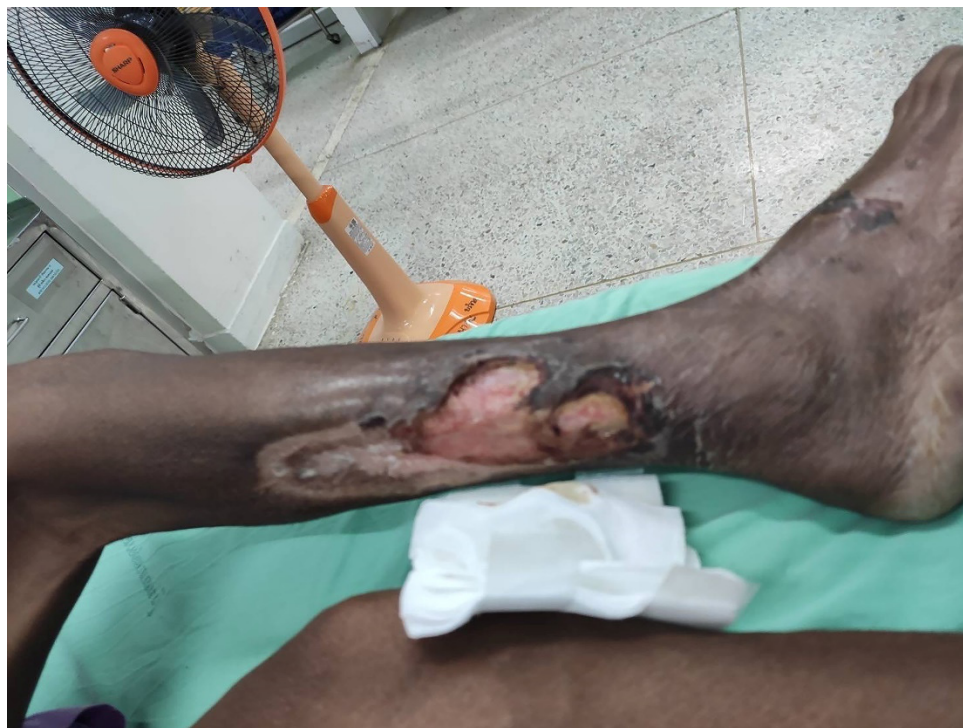
Figure 1. Photograph of human pythiosis. A 46-year-old Thai male with thalassemia was diagnosed with vascular pythiosis. CTA showed the occlusion of the right aorta, and ELISA showed the positive IgG against P. insidiosum (with permission). Abbreviations: CTA, computed tomography angiography; ELISA, enzyme-linked immunosorbent assay.

When an infection is diagnosed as P. insidiosum , the therapeutic options include surgery, pharmacotherapy, and immunotherapy (Figure 1) [8]. Surgical intervention is the mainstay treatment for managing human pythiosis, but such treatment substantially increases the financial burden on patients, postsurgical complications, and uncontrolled infection [9]. Immunotherapy is a promising approach for human pythiosis treatment where antigens of P. insidiosum from in vitro cultures are injected into the patient [10,11]. The mechanism behind P. insidiosum antigen (PIA) immunotherapy in human pythiosis includes a switch from the host's T helper-2 (Th2) to T helper-1 (Th1) mediated immune response in the host; the Th1 response producing higher levels of interferon- \gamma (IFN- \gamma ) and interleukin 2 (IL-2) [10,12,13]. Even though a good prognosis in PIA-treated patients can be implied by Th2 to Th1 switching, the efficacy of P. insidiosum antigen is inconclusive when used as immunotherapy in human pythiosis [7,12,14]. In vitro studies have demonstrated the anti- P. insidiosum effect of antifungals even though the P. insidiosum lacks the antifungal drug-target: ergosterol biosynthetic pathway [15]. However, a significant concern with antifungals is the contradictory results in susceptibility to P. insidiosum in in vitro and clinical use [15,16].