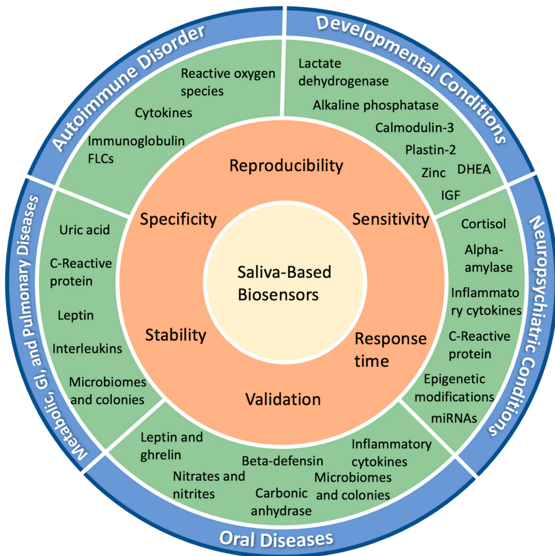
Figure 1. Prospects for saliva-based biosensors: various biomarkers have been identified in systemic conditions; discussed here are autoimmune disorders, developmental conditions, neuropsychiatric conditions, metabolic disorders, gastrointestinal disorders, pulmonary diseases, and oral diseases. For biosensing applications, they should be assessed for: their reproducibility at different time points, locations, and populations; specificity towards the marker and disease; sensitivity, meaning they should be able to detect as low a concentration of the markers as possible, ideally lower than a clinically available test; the response time of the assay, preferably shorter for quicker results; and validation in clinical conditions in larger population sizes.