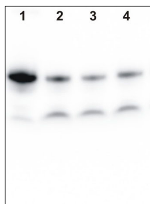
Figure S1. Assessment of MLNC resistance to nucleases by polyacrylamide gel electrophoresis. 1-control siRNA sample, 2-4 – siRNA samples after 4 h incubation in 10% FBS, experiment was carried out in triplicate.

Tel.: +7-(383)-363-5163 (I.S.D. & E.I.R.)