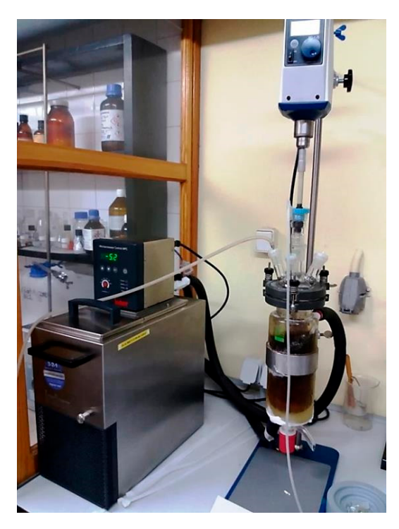
Figure S1. The photograph of the lab set employed for the N-AgNPs preparation taken during the synthesis.