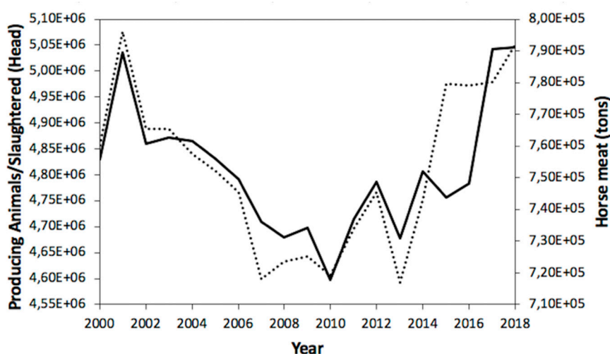
Figure 2. Global consumption of equine meat per year. Worldwide slaughtered horses (line) for the production of horse meat (dot) for human consumption per year. Data obtained from Food and Agriculture Organization Corporate Statistical Database (FAOSTAT) ( http://www.fao.org/faostat/en/#data ) on-line information system (last accessed on 10 July 2020).

Horse meat consumption is not only affected by cultural, social and religious factors but also by strong regulations. Horse meat and its by-products can be considered as legitimate food ingredients or products for human consumption only if appropriate actions are taken such as veterinary inspections and slaughter in approved and certified slaughterhouses [84]. Should be noted that not all equines could be slaughtered for the production of meat for human consumption. Horses that are not bred for food (i.e., equids for sport competition) that are regularly administered with drugs or other chemicals are forbidden. Moreover, horses that have been euthanized by mean of lethal intravenous injections of drugs (i.e., sodium pentobarbital) could not be used for meat production. The potential danger of eating meat contaminated with such chemicals is still completely unknown. To this, the EU, the FDA and the USDA prohibit the presence of many everyday equine drugs such as antibiotics, anesthetics, anti-inflammatories, de-wormers in meat for human consumption.