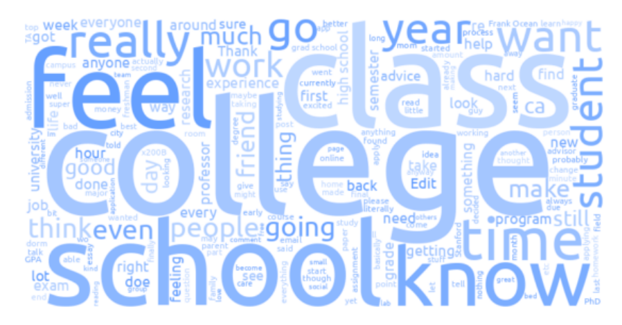
Figure A2. Word cloud for Reddit. Unigram counts: ' school ' (249), ' college ' (107), ' like ' (107), ' class ' (87), ' feel ' (76), ' year ' (72), ' know ' (68), ' time ' (66), ' really ' (63), ' want ' (59).