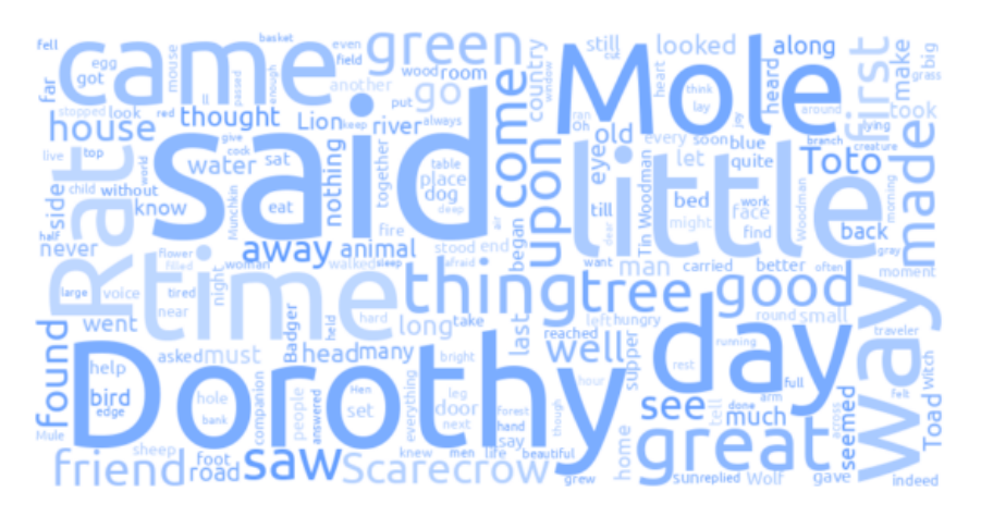
Figure A3. Word cloud for stories. Unigram counts: ' said ' (111), ' little ' (61), ' Dorothy ' (60), ' day ' (43), ' Mole ' (43), ' time ' (42), ' came ' (36), ' way ' (35), ' upon ' (33), ' Rat ' (33).