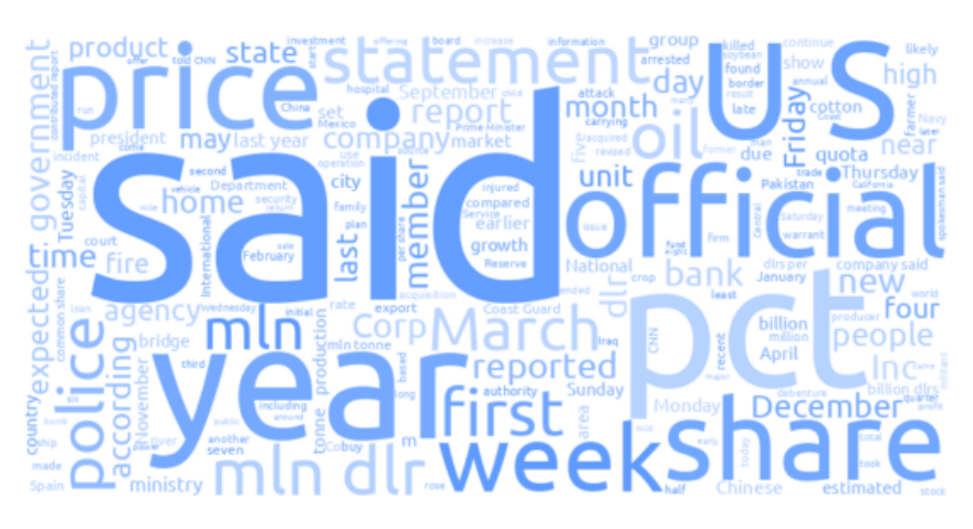
Figure A1. Word cloud for news. Unigram counts: 'said' (249), 'year' (74), 'pct' (61), 'mln' (60), 'dlrs' (55), 'share' (45), 'oil' (36), 'U.S.' (35), 'official' (31), 'price' (29).