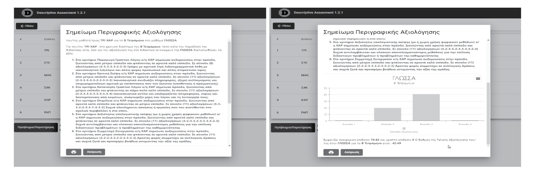
Figure 1. Assessment results (with and without graph).

A descriptive Rubric Score Application was developed for use in the educational process in the area of student performance assessment by primary and secondary teachers. The application analyses the assessment results at whatever level the teacher chooses (students, department, class, school, etc.) in real time and expresses them numerically or descriptively or in both ways depending on the choice of the teacher, as shown in Figure 1 (the text is in the Greek language). One of the rubric applications is presented in Table A1 (see Appendix A). It consists of six evaluative criteria with Graded Criteria Scales and evaluates students across six dimensions: reading comprehension, writing, critical thinking, participation—collaboration, diligence and computational thinking. The teacher has the ability to assess the student on any of these criteria. All criteria are scored on a 4-point scale, with 1 representing the minimum score and 4 representing the maximum score, as shown in Figure 2. Each score contributes to the evaluation result with a certain coefficient.