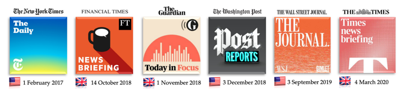
Figure 1. Daily podcasts produced currently by the most important newspapers in the USA and UK.

media have also adopted: radio (NPR, iHeartRadio, and BBC), television (CNN, ABC, and NBC), and the Internet (Vox and Axios).