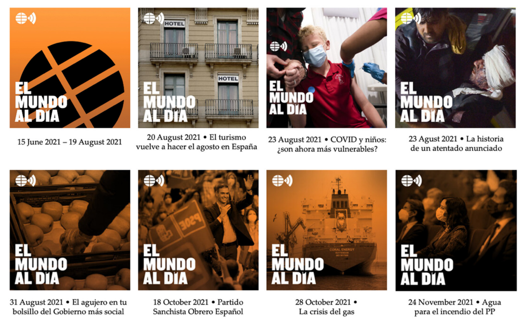
Figure 3. Evolution of the visual aesthetic of the covers of 'El Mundo al día'.

Its visual identity is striking, as in its initial phase (15 June to 19 September 2021) it was identified by a logo and intense corporate tone (dark orange); however, since the 20th of August 2021, the logo has been superimposed on an image in colour that aims to sum up the issue in question; this additional change would be adjusted a few days later, with the episode 'The hole in your pocket made by the most socially engaged Government' (31 August 2021); from then on, 'El Mundo al día' redefined its graphic appearance, which is now based on an image that refers to the news story in question treated with a filter with the same tone and the name of the podcast superimposed in white (Figure 3).