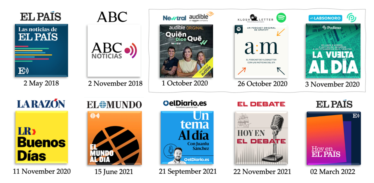
Figure 2. News podcasts of Spanish newspapers and audio platforms.