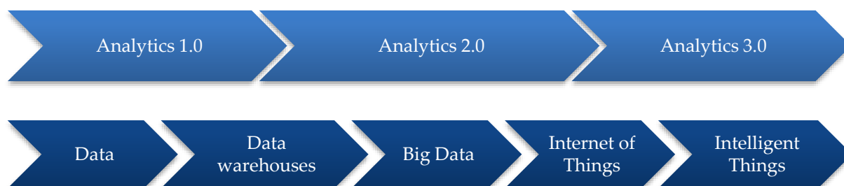
Figure 2. Analytics continuum.

In the Analytics 1.0 era, enterprises used data warehouses and copies of operational data as the basis for analyses (Figure 2). In the Analytics 2.0 era, the focus was on Hadoop clusters and NoSQL databases. Analytics 3.0 makes use of new, “agile” analytics methods and machine learning techniques that ensure a significantly quicker insight into data. Analytics 3.0 environment does not reject the existing concepts of analytics but integrates new technologies with the tools used so far [12].