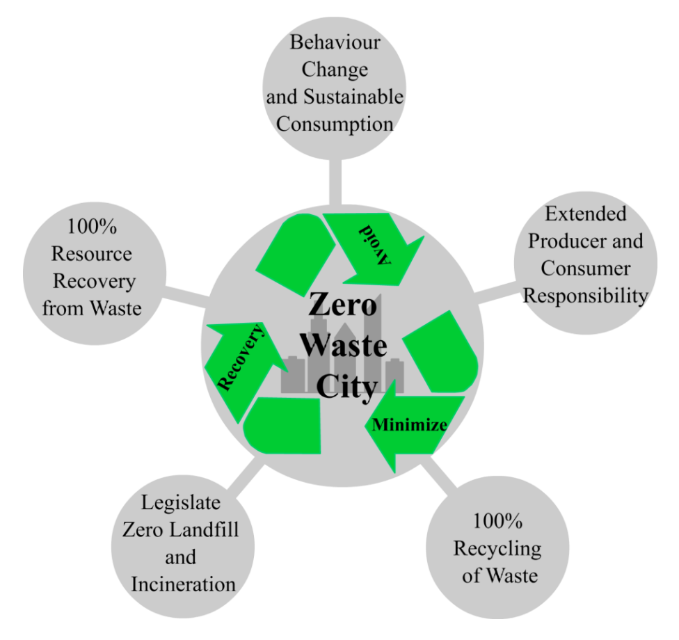
Figure 3. A holistic zero waste city model, with five inter-connected key principles that need to be applied simultaneously.

The zero waste city principles are developed based on waste hierarchy, i.e. avoid, minimization and recovery. Behaviour change and sustainable consumption practice will avoid the unnecessary waste generation from product production and use phases. Extended producer and consumer responsibility will ensure the sustainable choice of resource use and ownership of personal waste generation and management. An increased sense of responsibility will also lead to avoidance of waste generation. Resource and product stewardship would minimize the environmental impacts in the long term and ensure the wellbeing of the future generations by protecting resource through a behaviour shift from over-consumption to viable and sustainable consumption. By achieving total recycling of waste and legislation for zero landfill and incineration, a 100% recovery of resources would be possible in the zero waste city and thus ensuring the minimum depletion of finite natural resources.