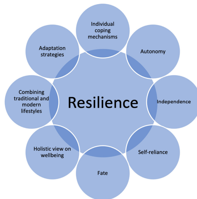
Figure 2. Factors promoting resilience, as found for the Sámi (search B).

Thematic analysis unveiled a spectrum of resilience-promoting factors perceived by the Sámi community. These are summarized in Figure 2. The Sámi appear to place a high value on ‘independence’ and ‘autonomy’ [41,62,78,79]. Within half of the Sámi literature examined [75–78], ‘individual coping mechanisms’ [76] were elucidated, often ingrained from childhood, such as ‘taking ownership of individual actions’ [75,78,79], maintaining resilience and optimism, or ‘carry on and be positive’ [75,76,79], and cultivating ‘self-trust, confidence, and perseverance’ [41,78]. In navigating challenging circumstances, Kowalczewski and Klein [62] found that their participants predominantly described individual coping mechanisms, such as ‘journaling, solitary retreats to reindeer pastures, and hiking,’ rather than communal strategies such as ‘seeking support from friends and family or engaging in group activities’ [62].