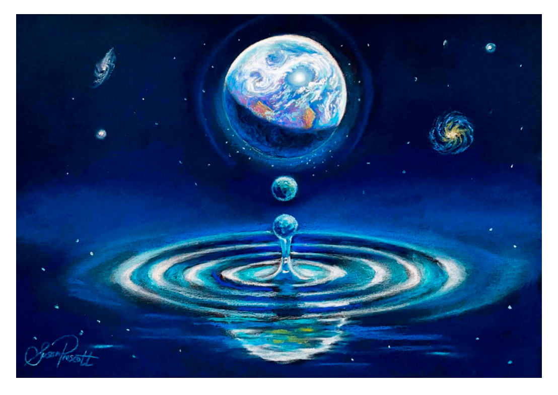
Figure 9. Project Earthrise. Creating ripples of change to bring the future into new focus through the power of imagination—it is time to imagine what kind of world we want to live in. Artwork by S.L.P.

In troubling times, such an expedition is more important than ever, remembering the grounding knowledge and ancient wisdom that can still guide our path [130]. There will be much to learn along the way; perhaps we might find a cultural artifact, our own "Project Earthrise", along the way, something to spark the imagination so badly needed in planetary health (Figure 9).