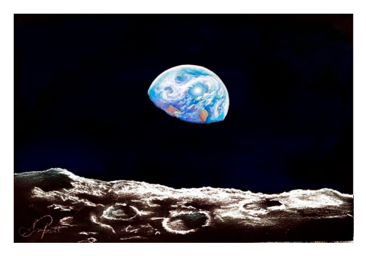
Figure 1. Earthrise. Inspired by the photograph taken by Apollo 8 Astronaut William Anders; one of the most influential images in human history. Artwork by SLP.

one major catalyst for the acceleration and coalescing of these movements—a project that was itself based on human imagination [8,9]. At first glance the relationship between a highly technical "hard" science enterprise like the Apollo program and so-called "fuzzy" science of nature relatedness, positive emotions and holism in health might seem bizarre, but the singular NASA "Earthrise" photograph provides the link (Figure 1). As NASA's Director of Photography for the Apollo Program would say three decades after the photo was taken, "it all ended up that nineteen cents worth of film became the most important part of a multi-billion dollar project" [10].