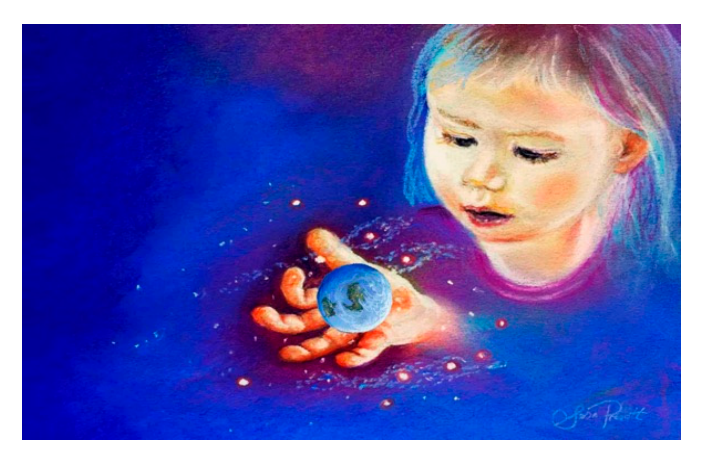
Figure 2. Planetary health depends on inspiration and imagination. Solutions will depend on the engagement that comes from unity and purpose, and the sense of awe and wonder inspired by nature. Artwork by SLP.

Thus, we will briefly examine the science of imagination and creativity to the extent that it might maximize the reach of planetary health through broad inclusion, and provide diverse viewpoints aimed at identifying the kind of world we want to live in. In doing so, we seek to place a higher value on creativity, imagination and self-development in solving challenges at all scales. We also emphasize the importance of cultural expression, artistic creations and narrative work in linking the health of people, place and planet. This will place more value on the power of positive emotional assets in health and resilience on all scales (awe, wonder, joy, love, compassion)—recognizing that these also mediate environmental concern and social responsibility. Finally, this leads toward the study of utopian thinking, an area which scholars have recently applied to the construct of planetary health [13]. We expand on this and conclude with a planetary health hypothesis of our own. That is, when imagining a better society beyond the current state of affairs—the essence of utopian thinking—there is likely to be large-scale solidarity and consistency in what that might look like. In an increasingly polarized world [14], finding common ground would seem like a good place for planetary health to find its roots, especially as we seek to inspire those who will inherit the future (Figure 2).