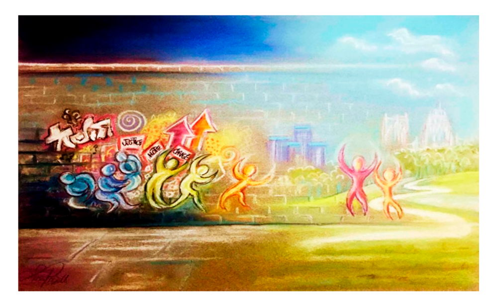
Figure 5. The unequal burden of the Anthropocene. The personal, social and economic challenges of the Anthropocene are shouldered disproportionately by those who have the least resources to cope with adversity. Achieving planetary health requires addressing inequities and recognising that the resiliency at all scales is dependent upon equity and diversity. Art by S.L.P.

myth [46]; individuals with pre-existing NCDs (the burden of global NCDs are shouldered by the disadvantaged [47]) are more susceptible to severe illness and mortality [48–50] (Figure 5).