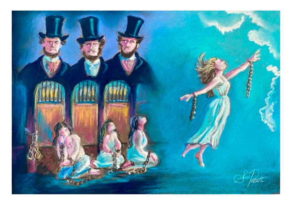
Figure 7. 19th Century humanitarians condemned and maligned. Those who advocated against physically restraining the mentally ill (many of them women, who may not have even had mental illness) were ridiculed as naïve 'utopians'. Fortunately, their dream came to pass. Art by S.L.P.

There is little doubt that these 19th century physicians used imagination and symbolic construction to transform the environment (which is to say, "world") of their patients, a step closer to utopia compared to previous conditions; yet if they were still alive, we feel confident that these same physician "utopians" would be appalled at the current status quo which allows "developed" nations to use prisons as their primary mental health institutions [91].