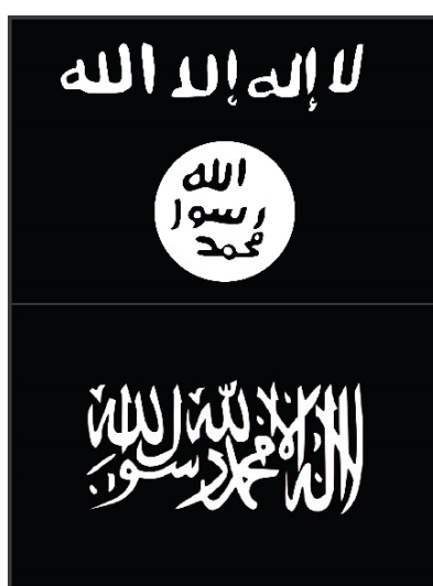
Figure 5. Variant of the flag used by the Islamic State/Daesh (top) and the Flag of Hizb ut-Tahrir (bottom).

While Da’esh and Hizb ut-Tahrir are both extremist organisations, they represent different extremes on this spectrum. Da’esh is firmly located within jihadi frameworks, while Hizb ut-Tahrir Indonesia stands outside the jihadi milieu. Though they are separate organisations, the similarities in their flags (Figure 5) signal some commonalities in social, cultural and religious values. At a very basic level, both organisations are joined by the notion of Caliphate that breaks down divisions between Muslim countries. Moreover, Hizb ut-Tahrir Indonesia’s active support for Da’esh is indicated in its participation in protests against Syria’s President Bashar al-Assad in Surabaya, Indonesia, in 2012. (Figure 6).