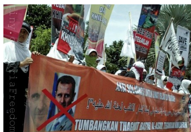
Figure 6. Indonesian members of the Hizbut Tahrir Indonesia (HTI) attend a protest against Syria’s President Bashar al-Assad in Surabaya on 3 March 2012.