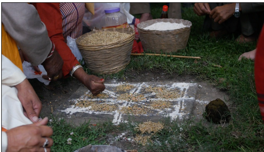
Figure 2. Empowering the yantra (Kahika Kharerna).

Having secreted the ḍāḍh from a plastic bag, the Nar wrapped it in white cloth and placed it at the centre of the ritual space above the square yantra. He then drew a replica of the base yantra on top of the device. Locked between these parallel, ritually empowered representations of the universe,