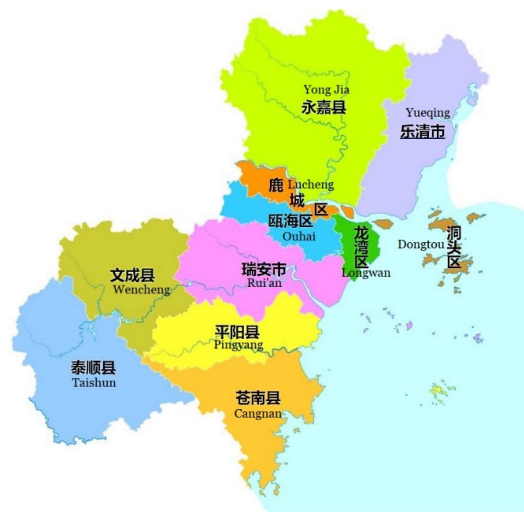
Figure 1. Administrative areas of Wenzhou.