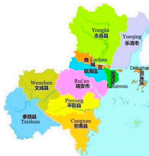
Figure 1. Administrative areas of Wenzhou.